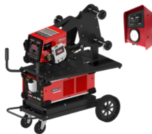
[K5440-2] Power Feed 84- Dual Cool Arc 55S