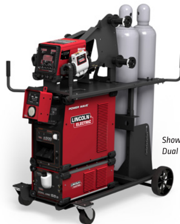
Shown: K4650-6 HyperFill - Dual Feeder Ready-Pak, Dual Cylinder Cart