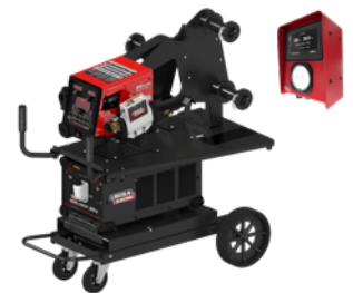
[K5440-4] Power Feed 84-Dual Cool Wave 20S

Not shown in image, Magnum PRO Water Cooled Gun