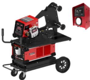
[K5440-1] Power Feed 84- Single Cool Arc 55S

* KP44332-15 ft liner will be needed for .045 HyperFill applications.